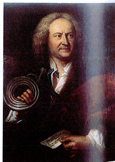
ABOVE: The trumpeter Gottfried Reiche (1667–1734), who played the high clarino parts in Bach's works in Leipzig.

While most of Bach's compositions up to 1717 had been organ works and sacred cantatas, he now exploited the instrumental resources available to him at the Cöthen court. Most of his work there was secular, since the Calvinist Prince Leopold required little sacred music. Among the works he composed during this period were the six Brandenburg Concertos for various instrumental combinations, together